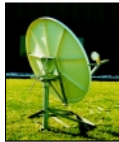
Back View 1.2M Rx/Tx

Prodelin Corporation is the world's largest manufacturer of Rx/Tx VSAT antennas. We have the broadest product line in the industry including Receive Only, Rx/Tx and Rural Telephony antenna systems. Prodelin offers nineteen antenna sizes, 47cm to 4.5M. Prodelin is the leader in obtaining type certifications and approvals for Intelsat, AsiaSat and Eutelsat. Prodelin antennas provide the best quality in the market due to the sophisticated, precision SMC compression molding process technology. Prodelin provides the best value antenna solution to the market with competitive prices, the highest quality products and superb engineering support. Prodelin is ISO registered, KEMA # 70022.01. Prodelin - The Market Leader in VSAT Antennas.